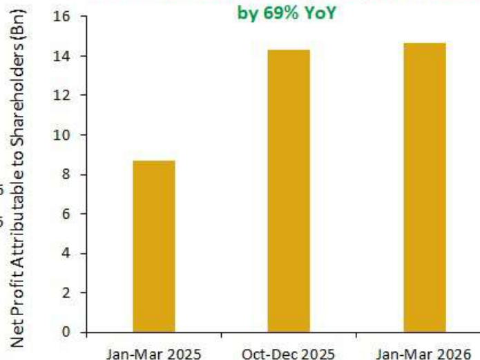
Cumulative Net Profit Attributable to Shareholders increased by 2% QoQ, increased by 69% YoY